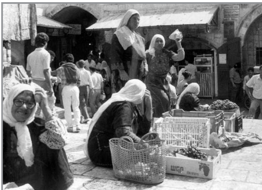
"How can we defend women who the law does not consider to be workers?"

"Some 56,000 wage employment positions were lost and replaced by over 47,500 self-employment positions ... mostly in subsistence agriculture, petty trade and personal services," observes the ILO Report on the Situation of Workers of the Arab Occupied Territories, International Labour Conference, 92nd Session, 2004.