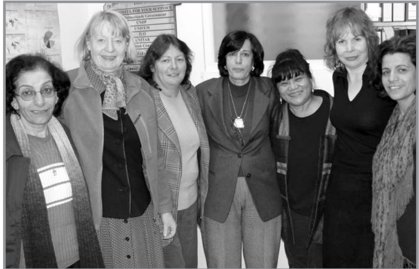
Zahira Kamal, the Palestinian Authority’s first Minister of Women’s Affairs (in the centre) surrounded by members of the PGFTU Women’s Committee and the ICFTU Women’s Committee delegation.

Women workers in Palestine are concentrated within a limited number of traditionally “female” sectors (education, health, agriculture, textiles), a situ-